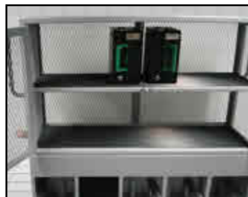
Detail of cashbox trolley