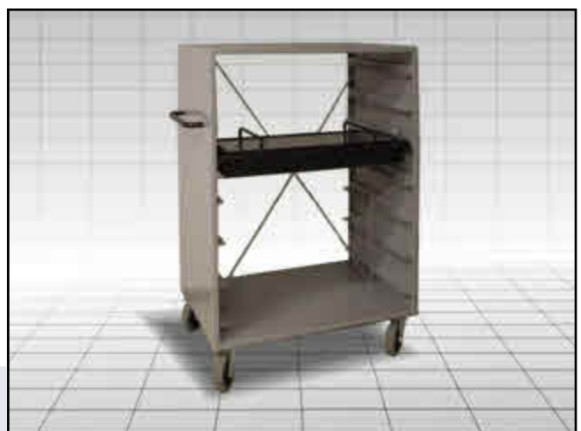
Trolley for 2x7 special Holland Casino chip trays