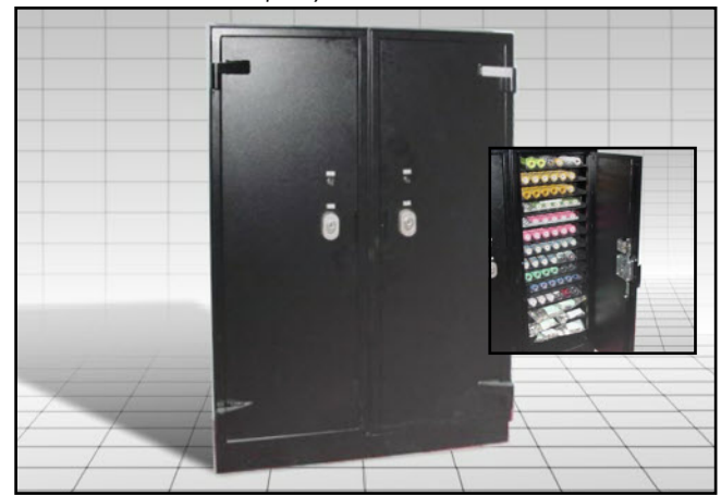
Safe used at cage. Picture shows 2 separate safes mounted together. Each safe is suitable for one individual cage.

Detail: Shelves for 15 chip racks of 300 chips each