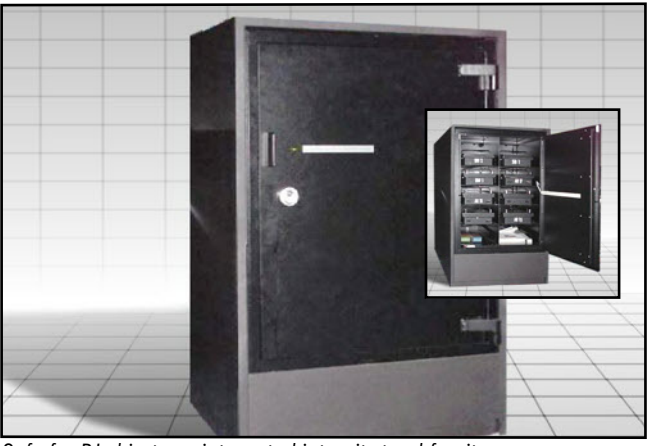
Safe for BJ chip trays integrated into pit stand furniture. Detail: Shelves for 10 chip trays.