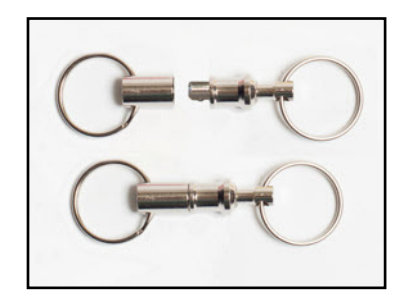
Two-Part-Keyring Can be used to remove the Key Bak from the tamperproof ring with the keys and I-Fob when putting back in the TRAKA.