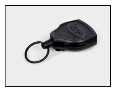
The Key Bak S48 Locks to carry more weight Unlock to extend Extension Cord: 1.2 mtr

Simply attach your keys to the Key Bak, and forget about ever losing your valuable keys again. It is also possible to use tamperproof rings as a key ring.