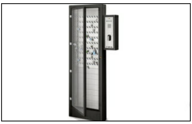
(Note: Roller Shutter door cabinets have different dimensions)