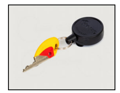
The Key Bak Midi: Holds up to 5 keys Extension cord: 90 cm 360 dgr. rotating clip