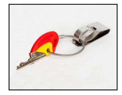
The Belt Clip is a clever solution, enabling the key ring to be easily clipped on and off.