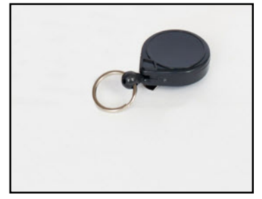
The Key Bak Mini: Holds 1-2 keys or access control chip/card Extension cord: 90 cm

Tamper-Proof flexible key rings; this product eliminates any covert key removal and substitution. Once sealed, ring cannot be opened without detection. Each ring is engraved with a unique serial number.