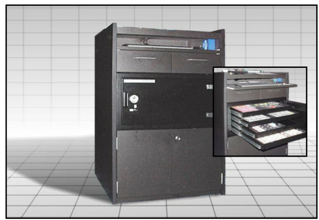
Safe for chip racks integrated into pit stand furniture. Detail: 4 drawers each for 4 chip racks of 200 chips

The advantage of such a custom safe is to save on the transportation of the chips and floats etc. to the vault.