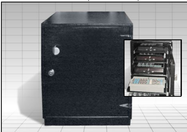
Safe for 10 standard TCS JH/Abbiati chaptrays or wooden Attaché flat cases. Detail: 5 drawers for each two units.