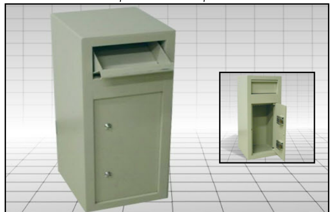
Standard safe with drop-in drawer, used in count rooms etc. Detail: 2 BiLock cupboard locks on door. size of compartment; 25 x 25 x 40 cms. Also available in 25 x 50 x 40 cms.