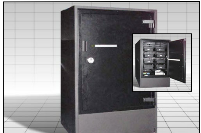
Safe for BJ chip trays integrated into pit stand furniture. Detail: Shelves for 10 chip trays.