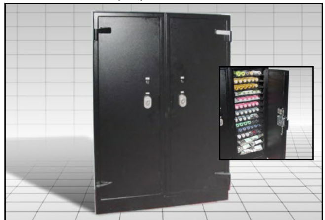
Safe used at cage. Picture shows 2 separate safes mounted together. Each safe is suitable for one individual cage. Detail: Shelves for 15 chip racks of 300 chips each