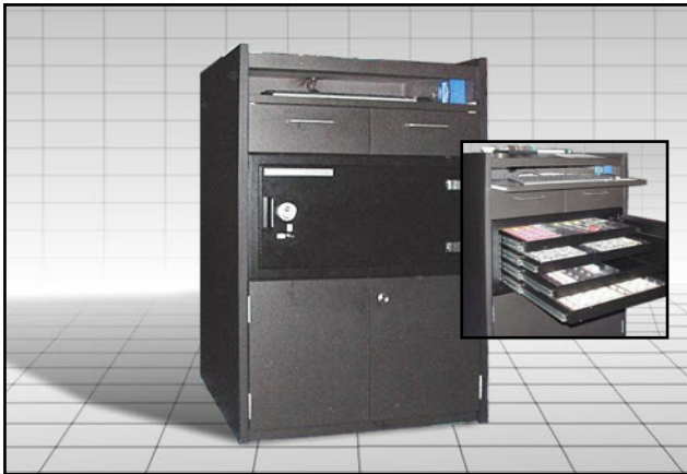
Safe for chip racks integrated into pit stand furniture. Detail: 4 drawers each for 4 chip racks of 200 chips

The advantage of such a custom safe is to save on the transportation of the chips and floats etc. to the vault.