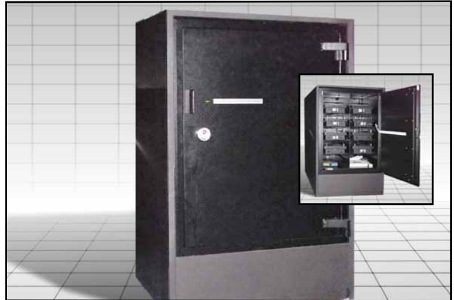
Safe for BJ chip trays integrated into pit stand furniture. Detail: Shelves for 10 chip trays.