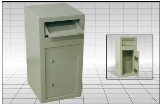
Standard safe with drop-in drawer, used in count rooms etc. Detail: 2 BiLock cupboard locks on door. size of compartment; 25 x 25 x 40 cms. Also available in 25 x 50 x 40 cms.