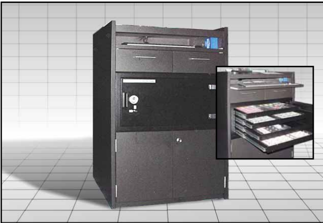
Safe for chip racks integrated into pit stand furniture. Detail: 4 drawers each for 4 chip racks of 200 chips

The advantage of such a custom safe is to save on the transportation of the chips and floats etc. to the vault.