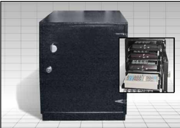
Safe for 10 standard TCS JH/Abbiati chaptrays or wooden Attaché flat cases. Detail: 5 drawers for each two units.