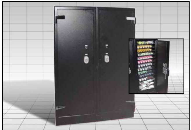
Safe used at cage. Picture shows 2 separate safes mounted together. Each safe is suitable for one individual cage. Detail: Shelves for 15 chip racks of 300 chips each